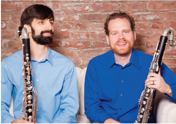
A not to be missed concert by the one and only SQWONK, bass clarinetists extraordinaire.

The application and payment deadline is Saturday, April 18, 2020.